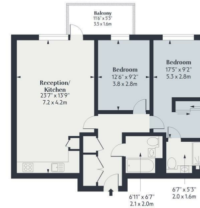
Fifth Floor Floor Area 805 Sq Ft - 74.78 Sq M